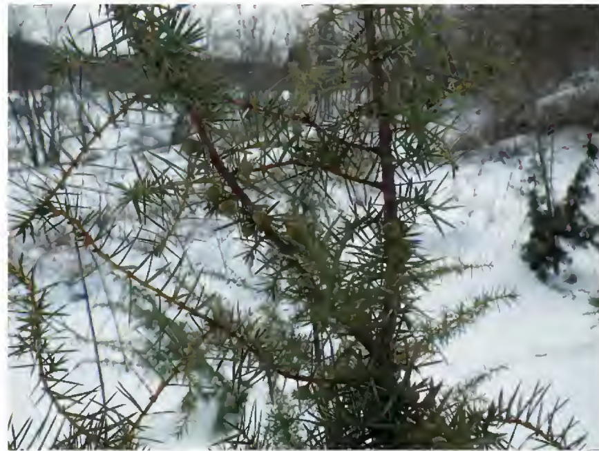
Fig. 6. v. communis , close-up, Lower Glady, WV